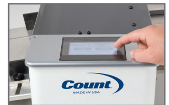
Touch Screen Controller

The COUNT™ iCrease Pro + is a robust solution for creasing and perforating digital media to eliminate cracking when folding. Get the automation of bigger COUNT machines in a simple hand-feed machine anyone can use. The iCrease Pro + can crease and perf in one pass (no need to refeed!), with multiple crease locations and perfect bind covers, with choice of automatic hinge placement or no hinge.