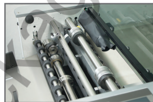
CAM Actuated Compression Creasing

Combines creasing and perforating in one simple yet powerful machine.