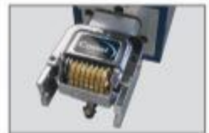
Numbering Head Wheel With Font Style Gothic (7)

With the investment in a single machine, you can handle high quality numbering, creasing and perforating all-in-one. The COUNT FC114 is available with reliable friction paper feed, or choose the FC114A bottom vacuum-feed machine. Both deliver accurate CAM actuated compression creasing with 2 crease widths, pneumatic numbering up to 24 times virtually anywhere on the sheet, plus perforating and optional micro-perforating. It's a compact, incredibly easy to use and highly versatile "all in one" solution that includes automatic "one-touch" set-ups.