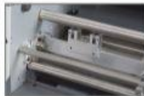
CAM Actuated Compression Creasing