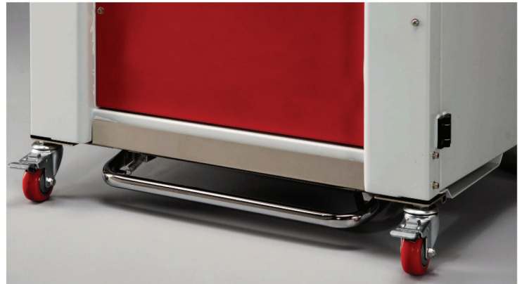
FOOT BAR ACTIVATION