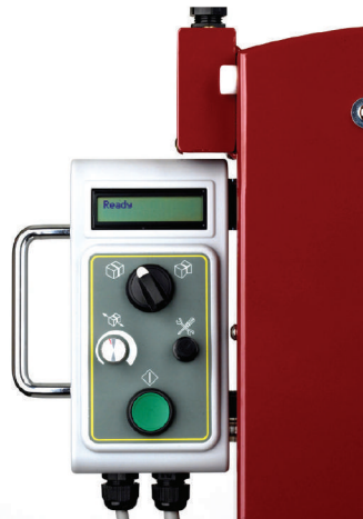
PIVOTING CONTROL PANEL